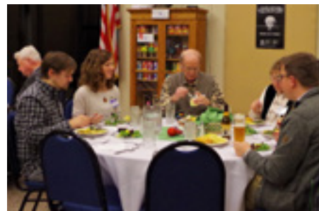
Members enjoy good conversation and a catered meal at the annual Holiday Gala.