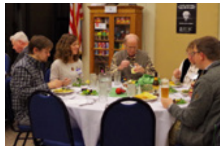
Members enjoy good conversation and a catered meal at the annual Holiday Gala.